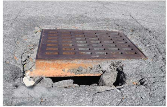
NFHS students, staff, and the whole community get to navigate things like this as they drive around the school. With beautiful fields and constant community use, the parking lot is not going to fix itself.