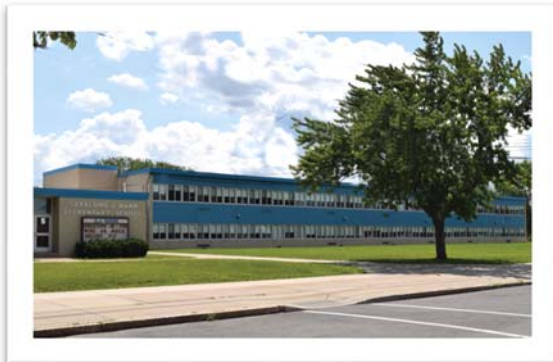
There are a lot of windows at GJ Mann, and they all need to be replaced.