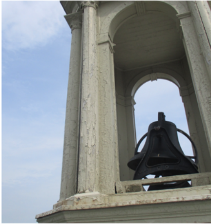
At left, the bell tower at Maple is a historic and attractive, and the bell is still rung every day. It needs repair.