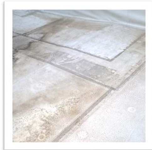
Below, that NFHS roof is about 20 years old. We've patched it and patched it, but it needs to be properly addressed, as do the roofs at Maple and Cataract.

Category 6 wiring would allow all our technology to operate smoothly. This is a necessary and geeky upgrade that would improve our technology lives and keep our considerable investment in all things tech playing nice