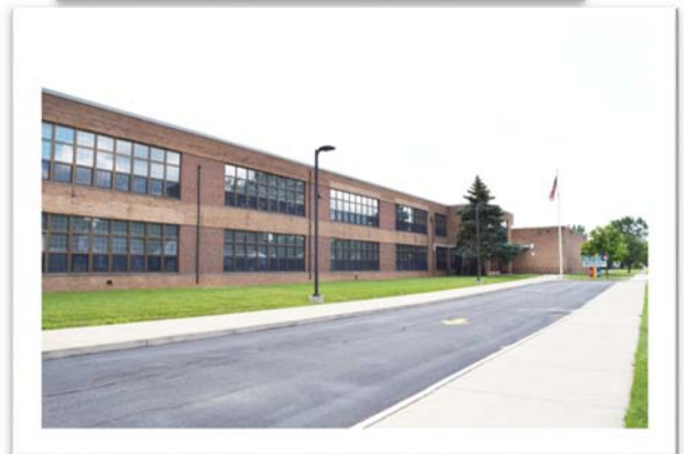
At right, 79th Street School remains the only school with no hot kitchen. We all know how many of our students rely on us for nutritious, hot meals. It's time to address this.